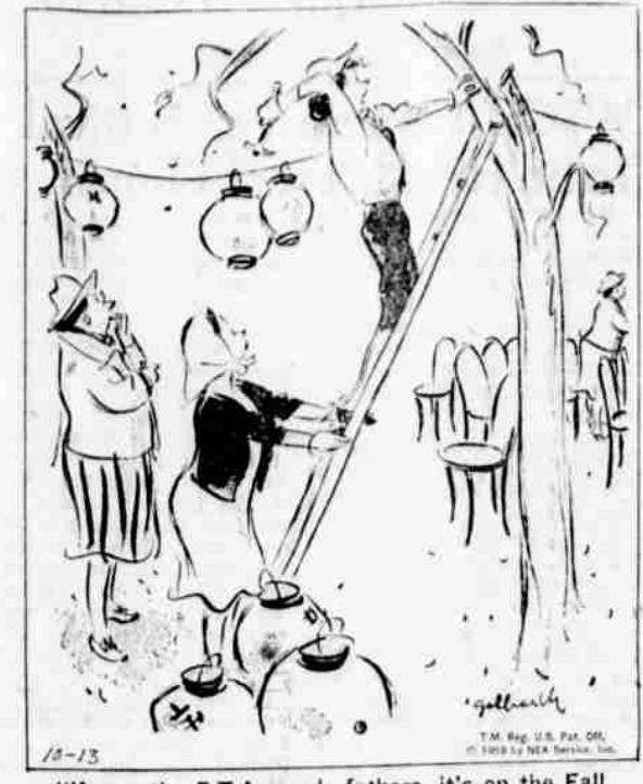
"If ever the P.T.A. needs fathers, it's on the Fall