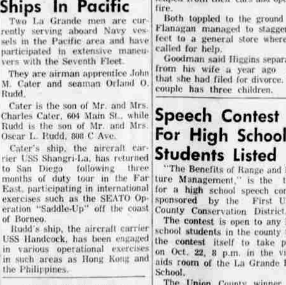
"The Benefits of Range and Pasture Management," is the topic for a high school speech contest sponsored by the First Union County Conservation District.