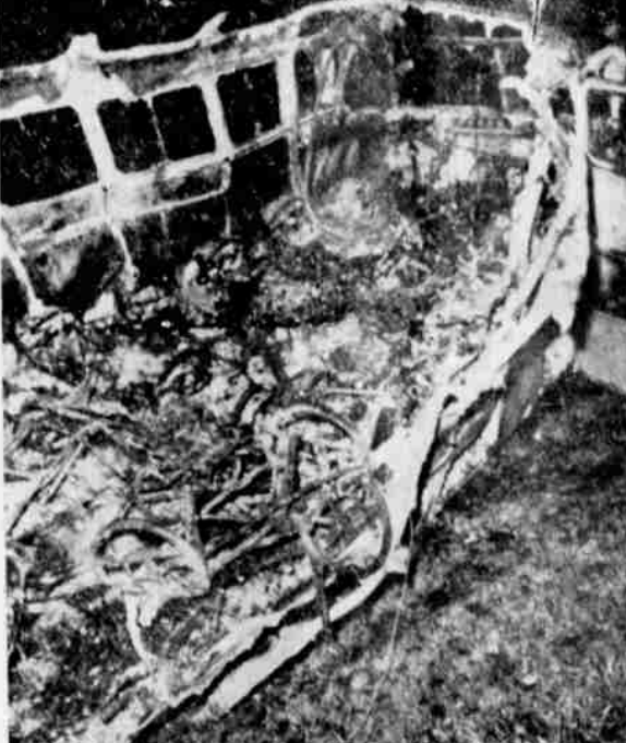
CHARRED RUINS — Only charred ruins remain of this bus which burst into flames after being hit from behind by a tank truck at an intersection near North Brunswick, N.J. The bus, which was filled with girl students from Trenton State College, stopped for a traffic light and was rammed by the truck. Nine girl students and a professor were killed. The group was returning from N.Y. where they had seen the Broadway play "J.B."