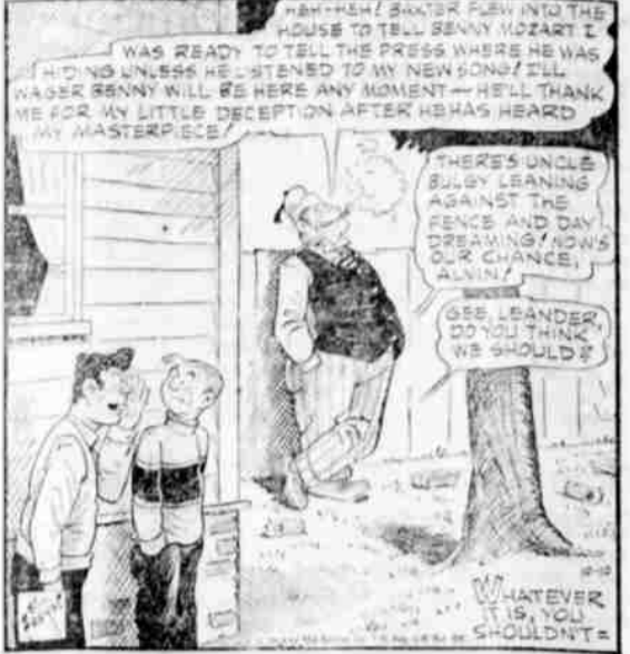
WHATEVER IS, YOU SHOULDNT