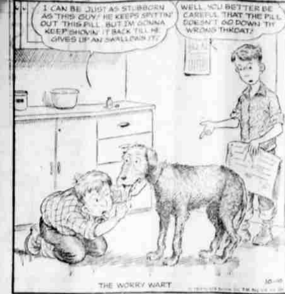
THE WORRY WART