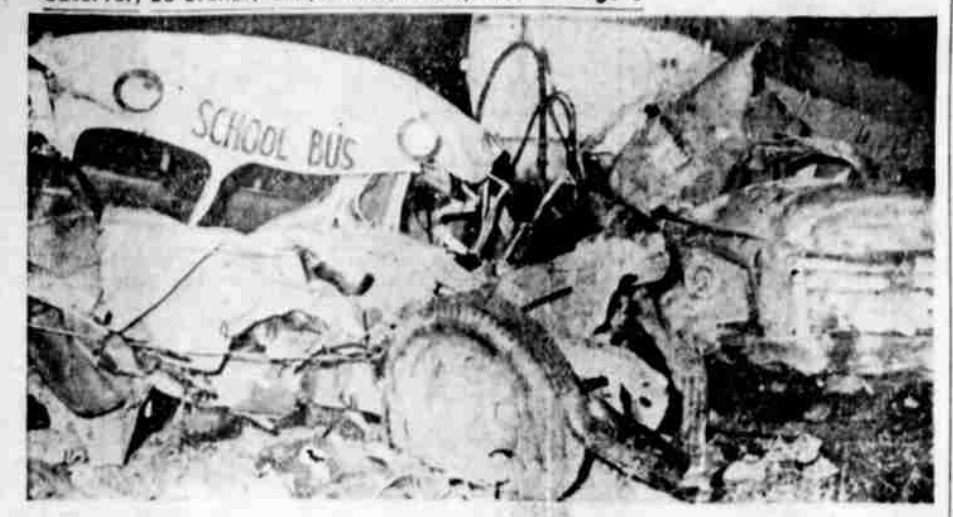
Observer, La Grande, Ore., Thurs., Oct. 8, 1959 Page 8

FATAL WRECK-Twisted metal is all that remains of a school bus after a truck loaded with sait smashed into it near Cooper, Texas. Four students, a teacher and the school principal died in the crash, which also injured the other 22 students and the truck driver. The students, members of the Pep Club from Mt. Vernon High School, were on their way to a football game.