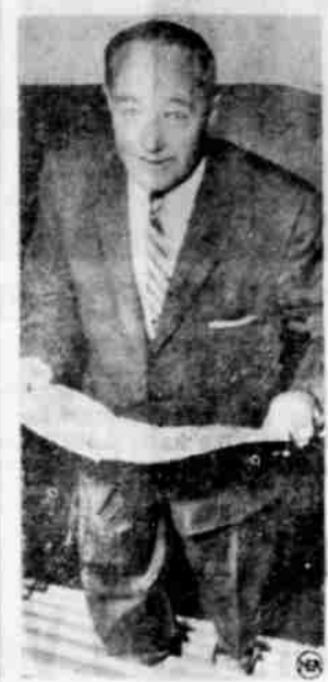
FRED HANEY Braves Boss Retires