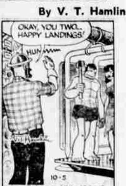
BOOTS AND HER BUDDIES