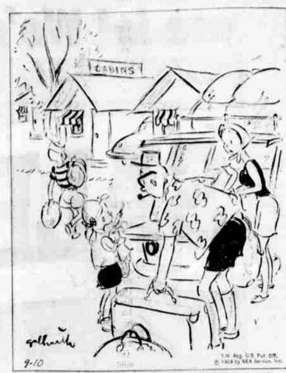
"My doll's pajamas are in one of those on top!"