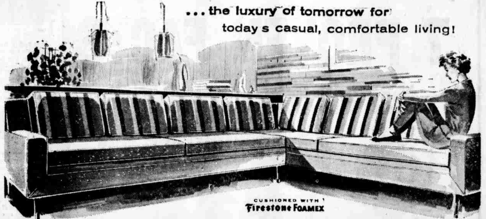
CUSHIONED WITH Firestone FOAMEX

... the luxury of tomorrow for today's casual, comfortable living!