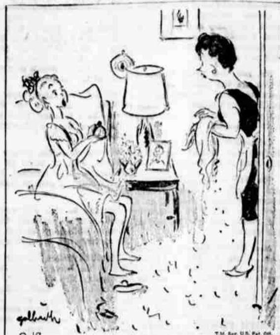
"I have a date with Jimmie for six o'clock in the morning. We're going to see if we can stand each other before breakfast!"