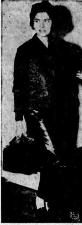
INFORMAL NOTE —Wearing loafers and leather jeans, Princess Soraya, former wife of the Shah of Iran, is the picture of relaxation as she arrives at the Dutch seaside resort of Noordwijk-Binnen, The Netherlands.

Closing date for acceptance of applications for persons entitled to veteran preference under custodial laborer announcement is