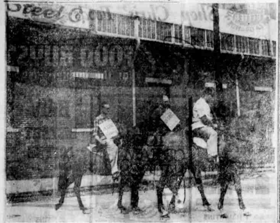
Observer, La Grande, Ore., Thurs., Aug. 13, 1959 Page 10

THE COST AIN'T HAY-Pickets at a Newport, Ky., steel plant arrive on horseback for a sit-down tour of duty. Cost of the nation's steel strike is, however, far from "hay." It is estimated that strikers and industry are losing a total of some 29 million dollars each day.