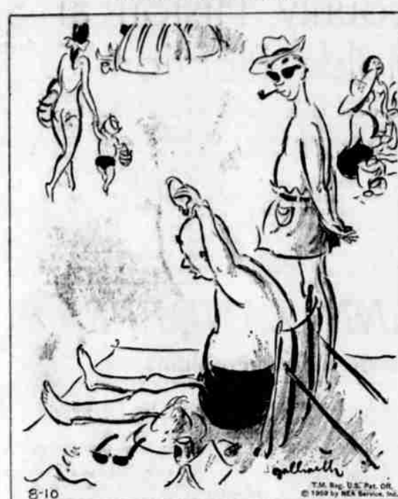
"Hair restorer on a two weeks' vacation? Man, this is suntan lotion!"