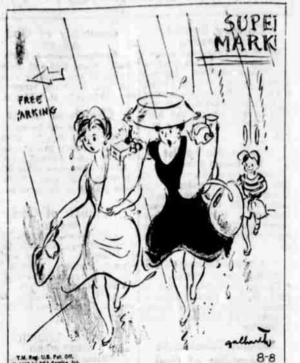
"I didn't really need a new dishpan, but this rain would simply ruin my hairdo!"