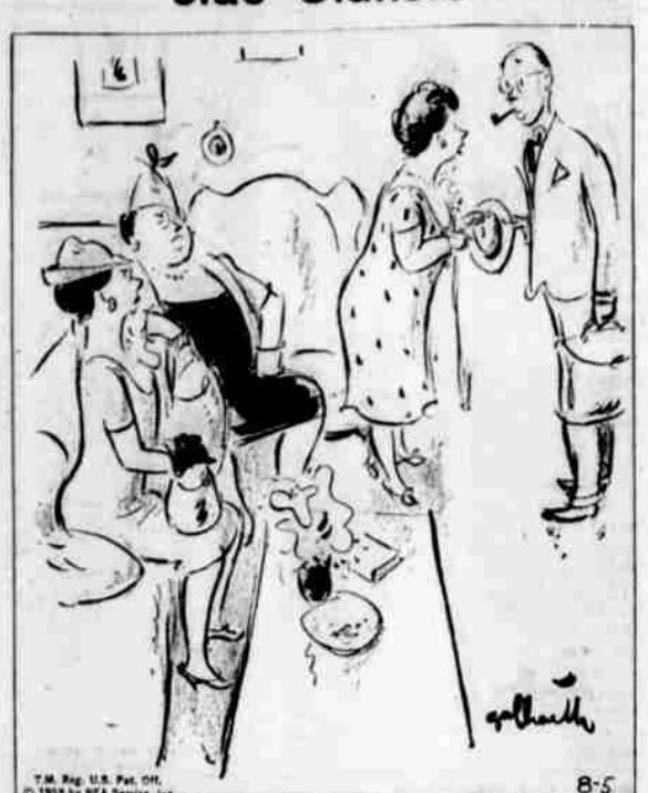
"Good—you're home early! We need somebody to settle our argument about the Middle East!"