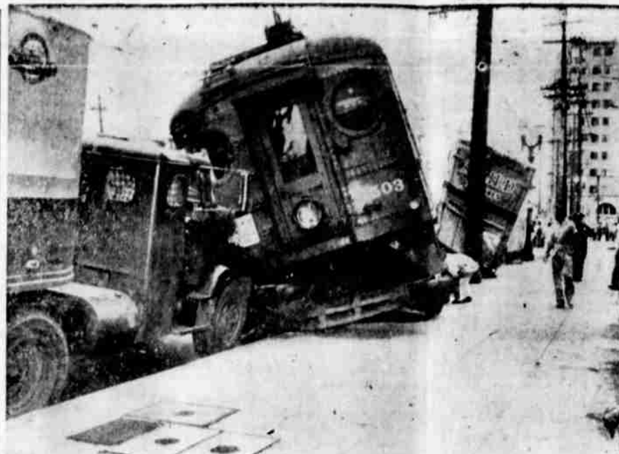
BRAKES FAILED —This interurban train failed to negotiate a turn in downtown Los Angeles after its brakes failed, left the tracks and crashed into three parked furniture vans. Eight of the 16 passengers were slightly injured.