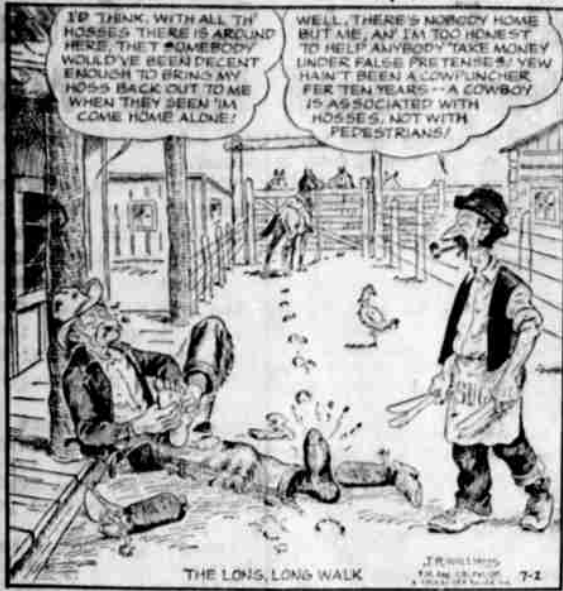
THE LONG, LONG WALK