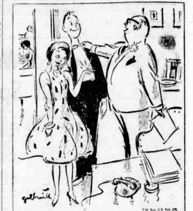
"You're marrying a good file clerk, my boy. She'll always know where your clean handkerchiefs are!"