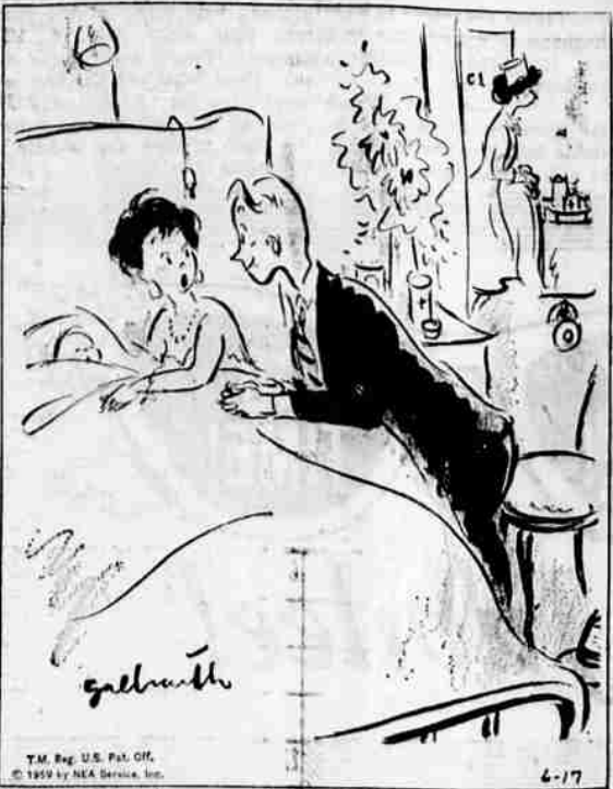
"Remember, dear, we decided baby talk was silly. Of course you can still talk it to me!"