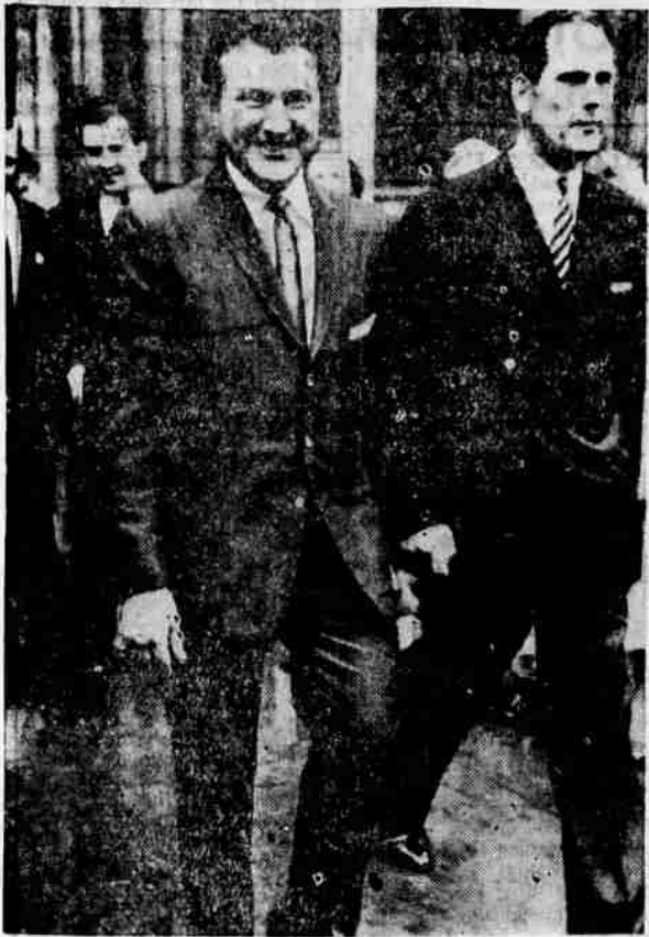
LIBEL SUIT —American pianist Liberace (left, smiling) walks into court in London, where he is suing British columnist "Cassandra" for suggesting that Liberace is a homosexual. "Cassandra" is a columnist for the London Daily Mirror, real name William Neil Connor. Man at right is unidentified.