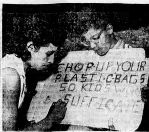
PLASTIC BAG WARNING —More than 50 schoolchildren in Morristown, N. J., are busy on a campaign to call attention to the suffocation perils of dry cleaners' plastic bags. Here two kids finish one of the placards which will be placed in public display around the town.