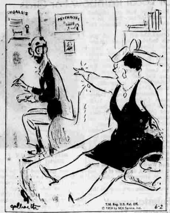
Are you trying to tell me that I have an inferiority complex?