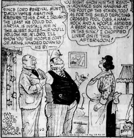
WE'VE COME TO HOOPLE MANOR