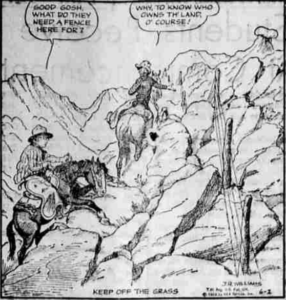
KEEP OFF THE GRASS