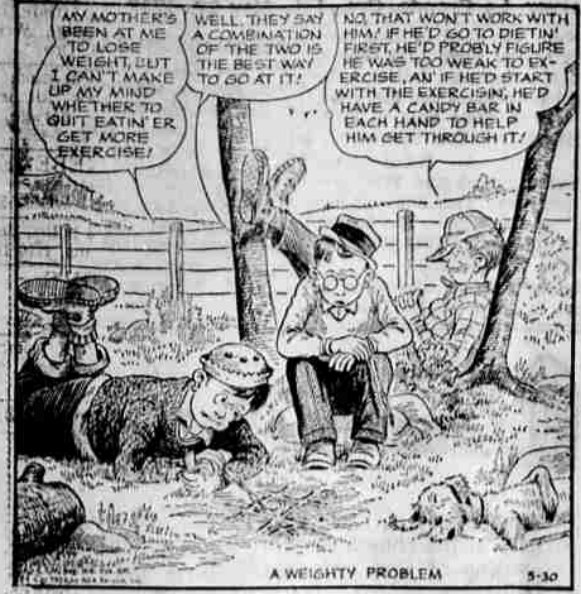
A WEIGHTY PROBLEM 5-30