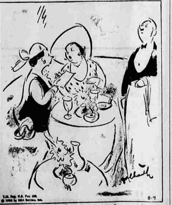
"Let's see—I traded my green beans for your dessert, so how much is my part of the check?"