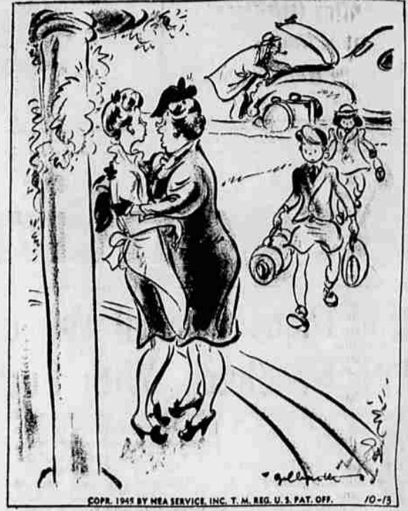
"It's like a dream, Ethel—little did we suspect last year at this time we could drive down to the football games and spend the fall weekends with you!"