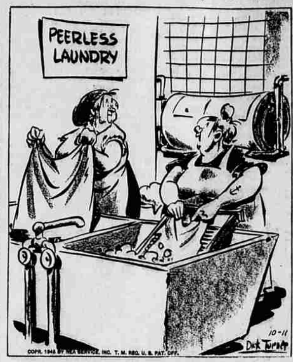
"I sent our own clothes here once—we nearly ruined them!"