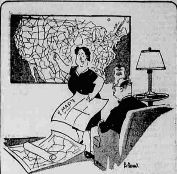
"Sure, your way is shorter. But we'll see more of the country my way!"

NORTON'S KIDDY SHOP 1114 Adams Phone 202