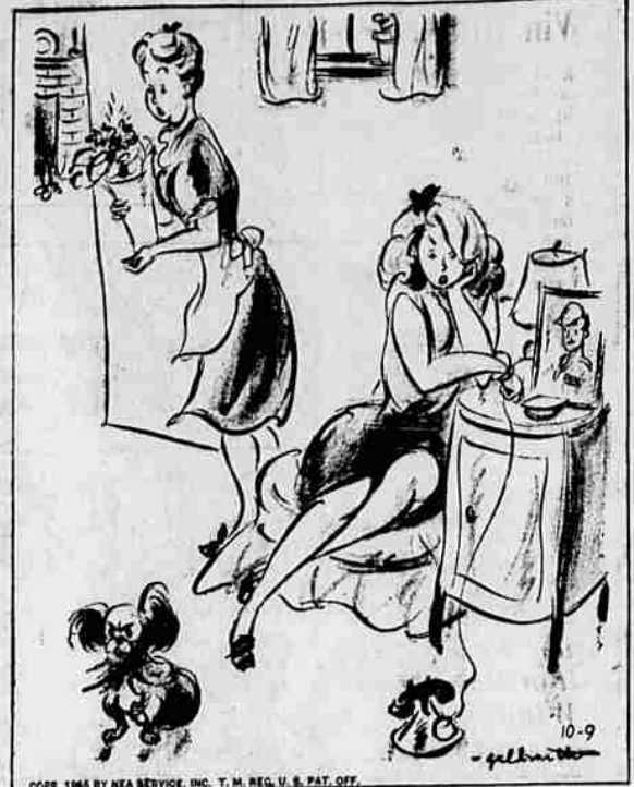
"You bet I'm mad! He didn't know I baked the cake I served him at the bazaar, but he didn't have to say it tasted like goo he had once in Kyushu!"