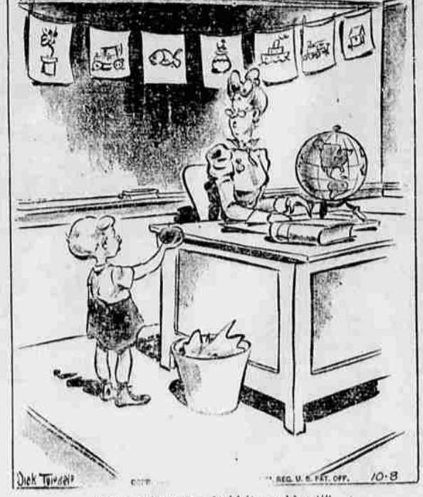
"My mother was afraid it would rot!"

Miscellaneous for Sale (Continued) LA GRANDE CYCLE SHOP — Harley Davidson side car, good condition, also Motorbike for sale. 219 Fir St. Phone 726