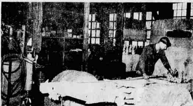
AT TOP—Showing forming operation with 300-ton hydraulic press. Also an acetylene welding operation.