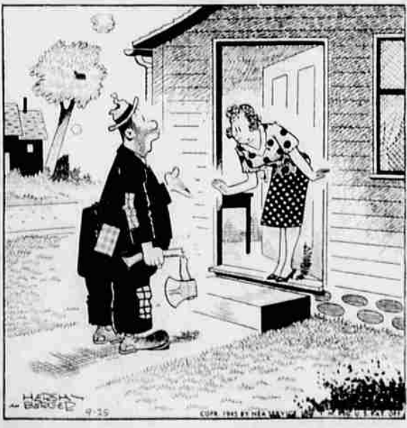
"Could a man who's been splitting atoms get a cup of coffee?"