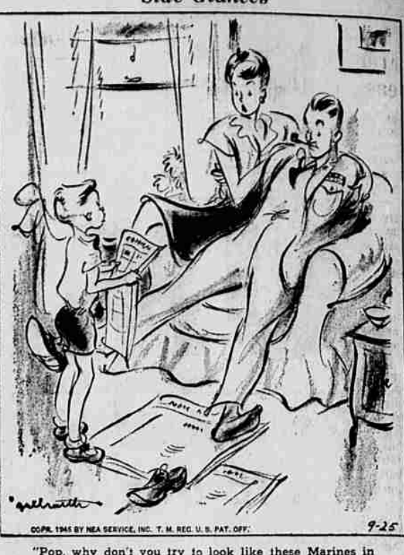
"Pop, why don't you try to look like these Marines in the comic strips?"