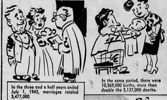
In the three and a half years ended July 1, 1945, marriages totaled 5,477,000. In the same period, there were 10,569,000 births, more than double the 5,137,000 deaths.