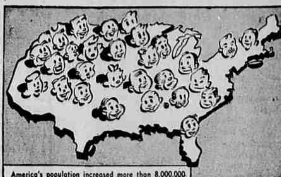
America's population increased more than 8,000,000 during the five years ended July 1. This almost equaled the increase of 8,894,000 for the 10 years ended July, 1940.