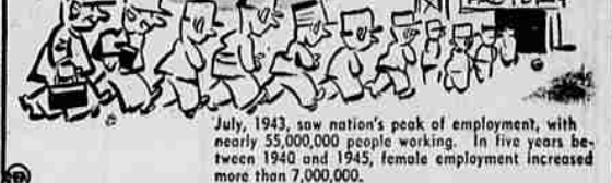
July, 1943, saw nation's peak of employment, with nearly 55,000,000 people working. In five years between 1940 and 1945, female employment increased more than 7,000,000.

WAR WORKERS: CUPID AND THE STORK —Record increases in population, births, marriages and employment during the war years are shown in official U. S. department of commerce estimates to last July 1 as illustrated in the sketches above. The 5,127,000 deaths reported during the period do not include war casualties.