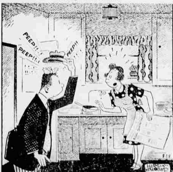
"The grocer slipped me three eggs, but told me to keep 'em under my hat!"