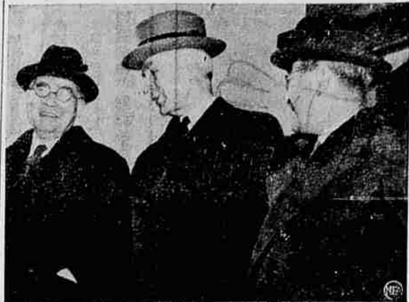
Jap "Peace Mission" With Secretary Hull—December, '41 "The divine mission of Japan puts her above treaty breaking. For Japan, any means justifies the end."

Yet, though the real nature of National Socialism was fairly well understood long before the war, Hitler had little difficulty in fooling the statesmen of the world by maintaining a front of "gentlemen" in his Foreign Office and his diplomatic service who gave