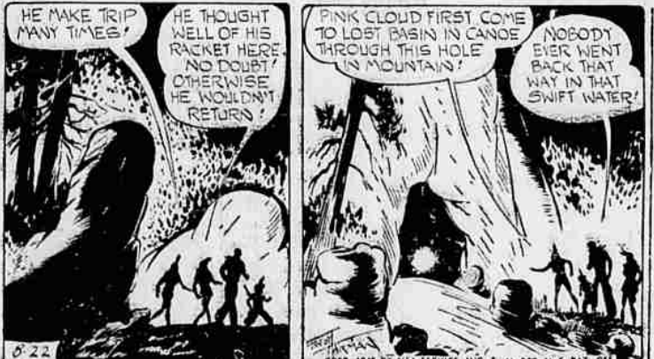
NOBODY EVER WENT BACK THAT WAY IN THAT SWIFT WATER!