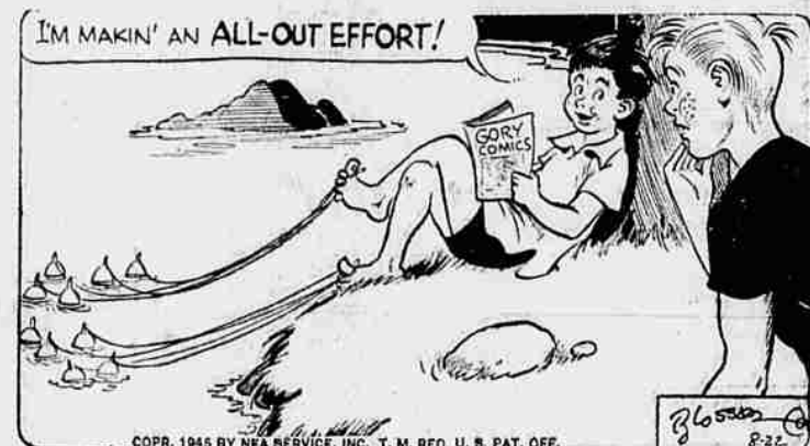
I'M MAKIN' AN ALL-OUT EFFORT!