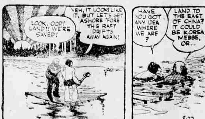
LOOK, OOP! LAND! WE'RE SAVED!