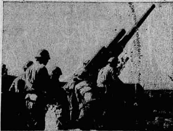
Symbol of "Radiant Peace"—1938

He has finally, within the limits of his office, done everything possible to mobilize the Japanese people for a "Holy War" for the destruction of the United States and the British Empire, and he has specifically acknowledged the Japanese "warriors" as his own representatives.