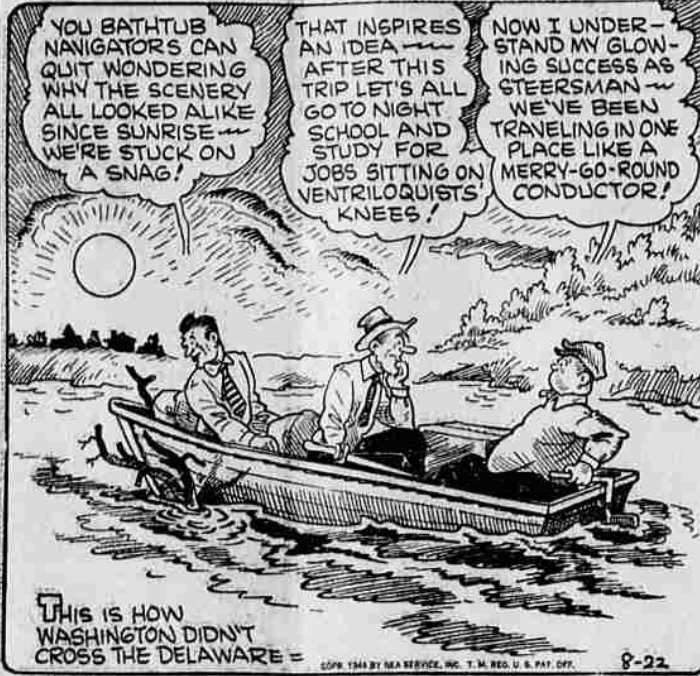
THIS IS HOW WASHINGTON DIDN'T CROSS THE DELAWARE =