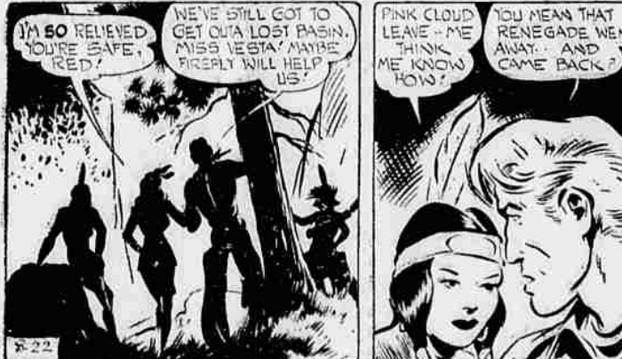
HE MAKE TRIP MANY TIMES!