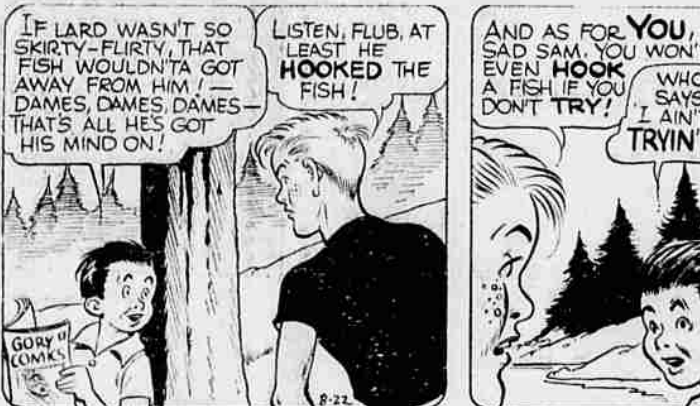
AND AS FOR YOU, SAD SAM, YOU WON'T EVEN HOOK A FISH IF YOU DON'T TRY!