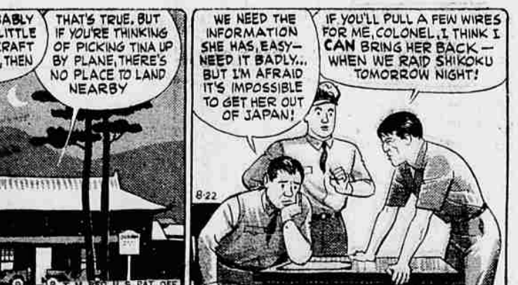
WE NEED THE INFORMATION SHE HAS EASY—NEED IT BADLY... BUT I'M AFRAID IT'S IMPOSSIBLE TO GET HER OUT OF JAPAN!