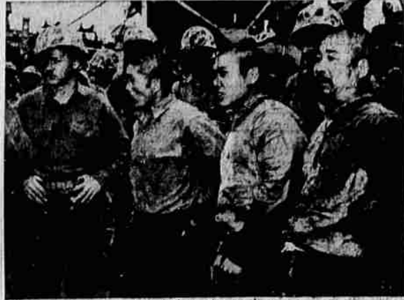
Jap Prisoners on Iwo "From the fact of the divine descent of the Japanese people proceeds their immeasurable superiority..."

Reduced to their elemental form, these Shinto concepts hold that the Japanese islands and the Japanese people have been born of the gods and are therefore di-