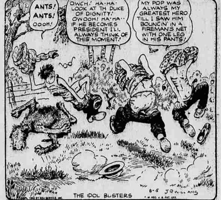
THE IDOL BUSTERS