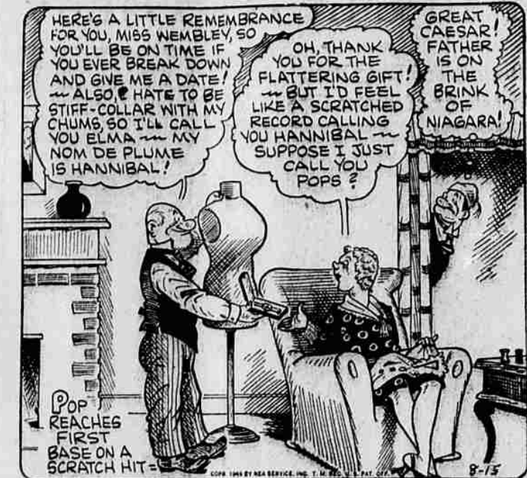
POP REACHES FIRST BASE ON A SCRATCH HIT