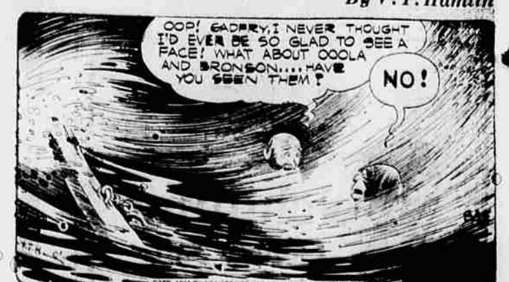
By V. T. Hamlin