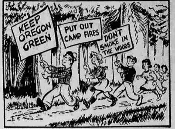
An army of 23,000 teen-age boys, girls in the Oregon Green Guard, pledge to KEEP OREGON GREEN. Are you observing the rules of common sense? Appoint yourself a fire warden. Keep Oregon Green Association—Salem, Oregon