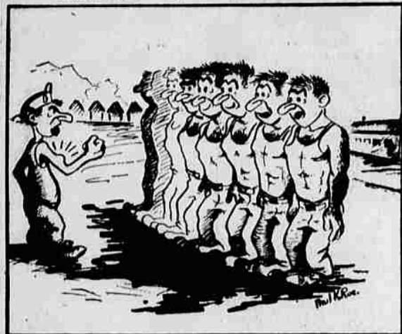
"An hour's workout each day will make men of you guys."