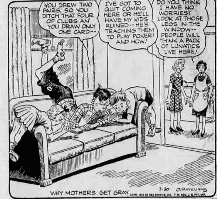
WHY MOTHERS GET GRAY 7-30 J. WILLIAMS