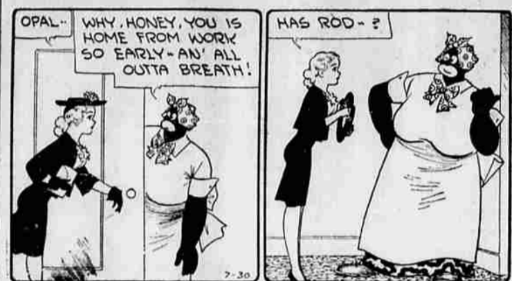
WHY MOTHERS GET GRAY 7-30 J. WILLIAMS