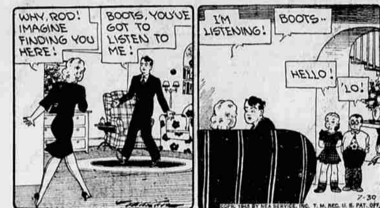
WHY MOTHERS GET GRAY 7-30 J. WILLIAMS