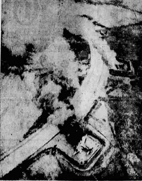
JAP PLANES TAKE BEATING ON GROUND —Jap planes burn in revirements at Jap airfield on Honshu after direct hits by U. S. carrier-based planes during July 14 attack by 3rd fleet as Japanese homeland becomes new object of Pacific operations.