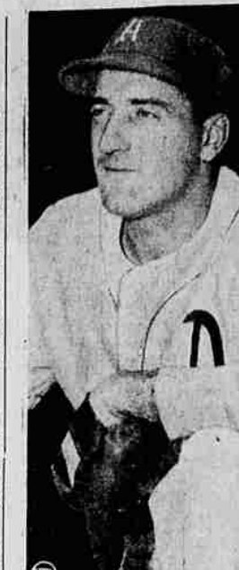
FREE AGAIN — Pitcher Phil Marchildon, first prisoner of war to return to diamond, is back with the Philadelphia Athletics after discharge from U. S. army. Here he is in dug-out at Shibe park.

One complete field range can be purchased by the U. S. army for $75 spent on a war bond.