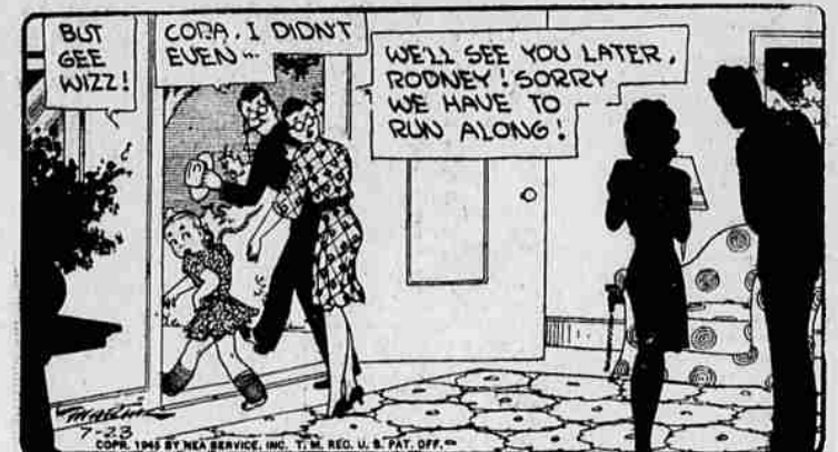
7-23