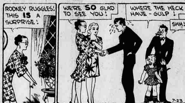
7-23