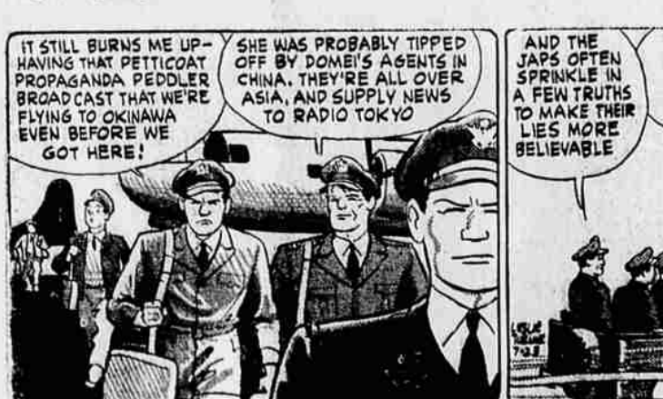
7-23 T. M. REG. U. S. PAT. OFF.