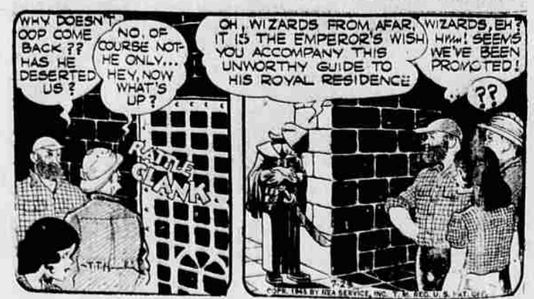
7-23