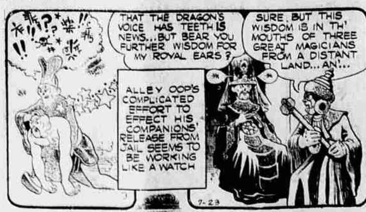
7-23