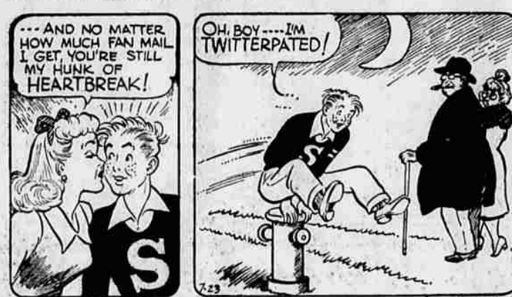
7-23 COPY 1945 BY NEA SERVICE, INC. T. M. REG. U. S. PAT. OFF.