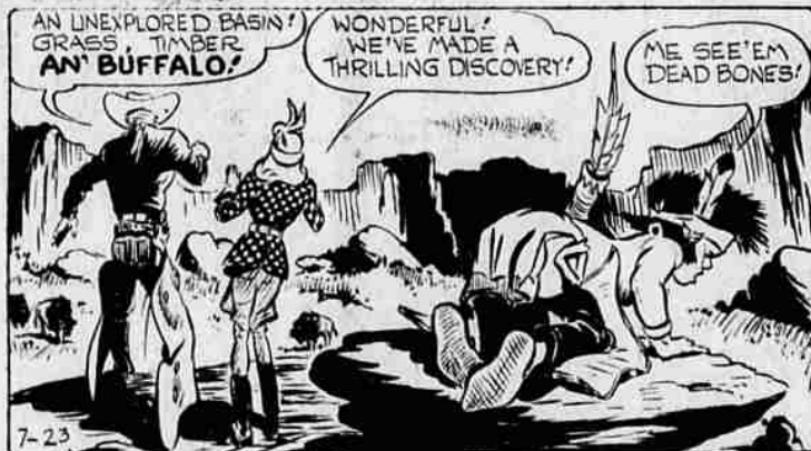
7-23 T. M. REG. U. S. PAT. OFF.