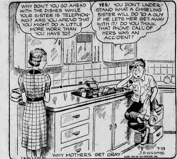
7-23 T. M. REG. U. S. PAT. OFF.