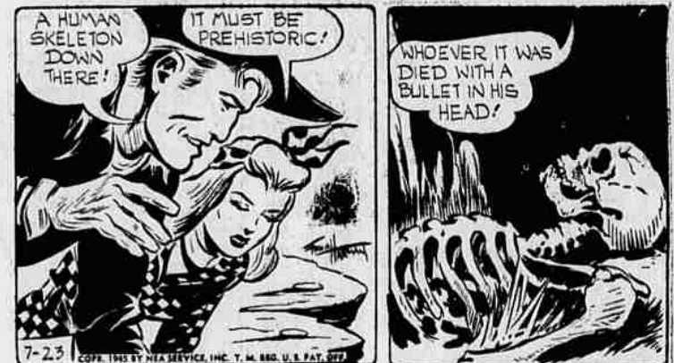
7-23 T. M. REG. U. S. PAT. OFF.