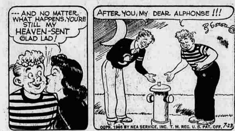
7-23 T. M. REG. U. S. PAT. OFF.