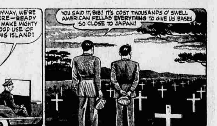
7-23 T. M. REG. U. S. PAT. OFF.