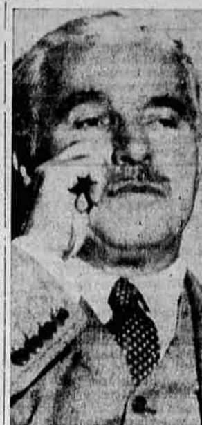
SAME OLD BATTLE — Twirling his first honest to goodness self grown mustache, comedian Charles Chaplin sits placidly in courtroom again where he faces another skirmish in his now famous paternity battle with Joan Barry. Both sides are appealing. Chaplin, the jury verdict declaring him father of Miss Barry's child; she, the amount of compensation, $75 per week.

The Oregon senator has promised to speak daily on OPA inadequacy until he gets action.