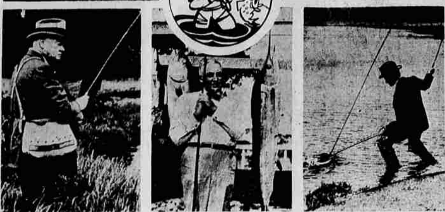
PRESIDENTS PREFER PISCATORIAL PASTIMES—Remember Harding angling for sailfish in the Gulf stream; Coolidge fishing for trout on Wisconsin's Brule river; Hoover angling in New England streams, and FDR pulling in those big ones off Florida's coast? Now it's President Truman who proves to be one of the country's 12,000,000 anglers, fishing for salmon during his recent visit to Washington. Above layout shows all these presidents in action, with Truman and FDR, left to right, above, and Hoover, Harding and Coolidge in that order below.