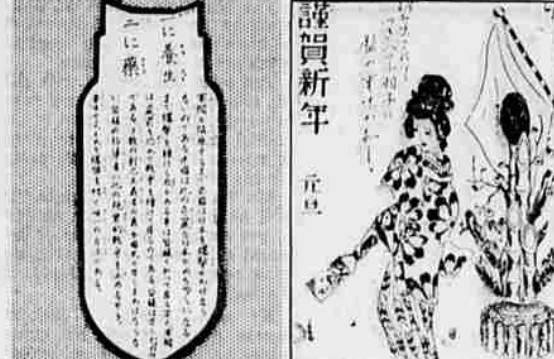
Effective leaflet urges Jap civilians to cease resistance. "Force your leaders to bring an end to a hopeless war," its message says. "That is the best prevention against destructive bombing."

Jap civilians as well as Jap soldiers are targets for propaganda barrages fired by psychological warfare teams. Here are examples of airborne leaflets dropped on Japan proper.