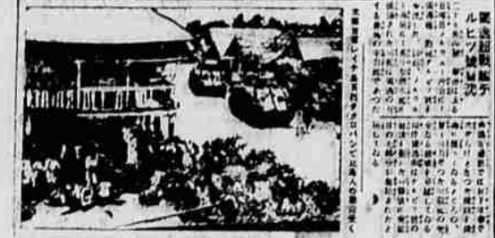
Makoto (Truth) is the name of this 8 by 11 inch newspaper, similar to Jap papers in format. Its aim is to infiltrate Japan with true news of allied victories, thus encouraging Jap defeatism. Japs distrust stories printed in their own papers, so news has proved to be strongest form of propaganda. This airborne edition tells of American progress in Philippine invasion.