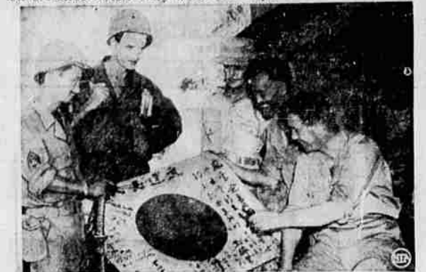
Typical psychological warfare team is this group, made up of Americans and Nisei (American-born Japanese). Here they check inscriptions on a captured flag to obtain useful data.

Allied propaganda includes colorful surrender passes dropped behind the Jap lines. Leaflets are used to convince Nipponese troops that prisoners of war are given good treatment. Some leaflets are directed to factory workers, urging them to stay away from plants that are sure to be targets of allied bombings.