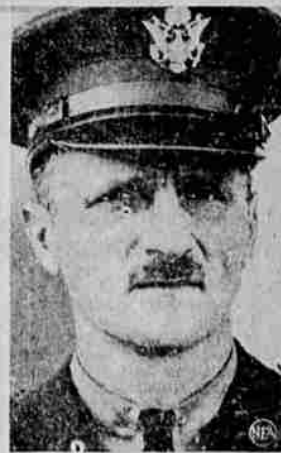
Gen. Carl A. Spatz

Havoc Awas Warrior Spatz bombers created awesome havoc in Germany. After seeing some of it Spatz said he guessed he wouldn't look at it any more. It is a shocking thing to see but it would look considerably worse against an American landscape than against the back-