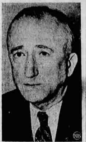
NEW SECRETARY?—James F. Byrnes, former war mobilization director, who is reported in Washington to be President Truman's choice to succeed Edward Stettinius as secretary of state.

GUAM, Friday, June 29 (UP)—A giant sky fleet of almost 500 Superfortresses showered more than 3,000 tons of fire bombs on three major Japanese seaports and a huge army training center in a pre-dawn multiple attack today. The B-29s attacked Sasebo, one of Japan's most important naval bases on the northwestern coast of Kyushu island; Moji, large shipping center at the northern tip of Kyushu facing Shimoda; and Onoda, on the southeastern Kyushu coast; and Okayama, site of an enemy army training base. Major Gen. Curtis E. Lemay's 21st bomber command Superfortresses flew in four separate formations and dropped their jellied-gasoline incendiaries in pre-dawn darkness. Today's raid, the 85th on Japan and the 12th this month, brought to approximately 4,500 the total number of B-29s that have assaulted the enemy homeland this month. Sasebo was hit before, early in the B-29 campaign. China-based Superfortresses struck at Sasebo July 7, 1944, blasting dockyards, drydocks, repair bases, arsenal and moorings capable of handling most of Nippon's battered navy. Today's raid was the first fire See FOUR WAR . . . Page 7