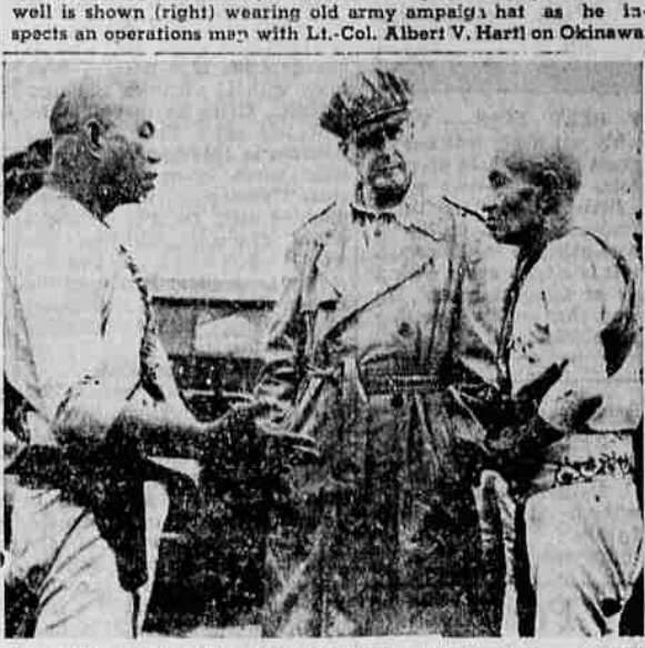
MacARTHUR VISITS SULU RULERS—The governor of Jolo (left) tells Gen. Douglas MacArthur about the greatness of the Sultan of Sulu (right), who has 26 wives and more than 100 children. The Moro natives of the Sulu archipelago were very friendly toward the allies.