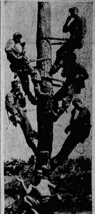
LOW MAN—Strange are the ways of the white man to the puzzled Okinawa native above, who squats on the ground as "low man on a totem pole" while five marine linesmen climb a tree to keep the leathern communications lines working.