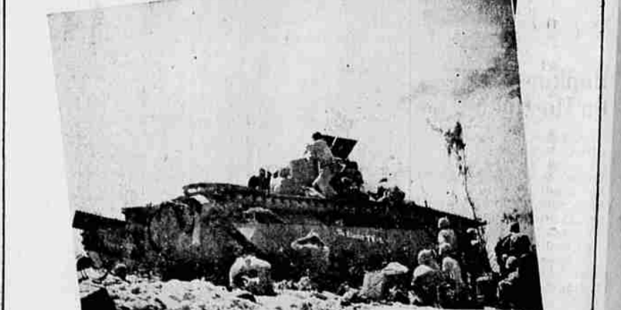
AMTRAC SHELTER—Engaged in the bitter struggle to establish the Peleliu beachhead, Marine Infantrymen carry on the fight from the shelter of an amphibious tractor which brought them ashore. THIS SORT OF FIGHTING IS STILL GOING ON!