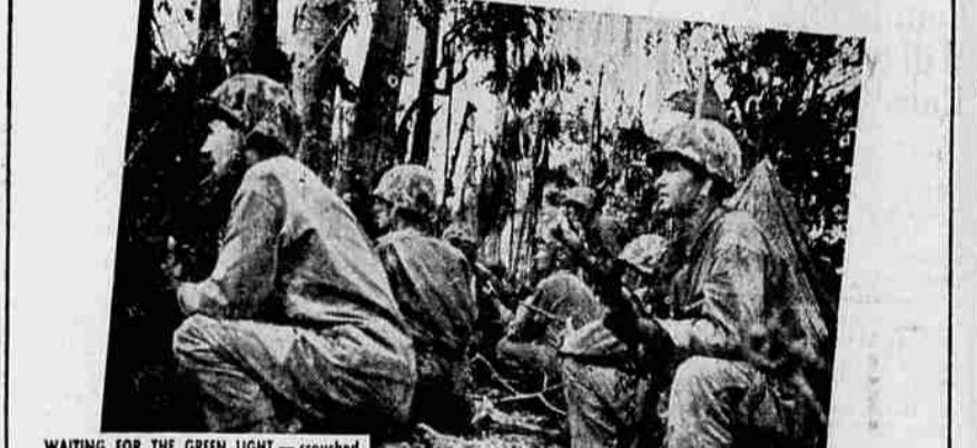
WAITING FOR THE GREEN LIGHT—crouched for protection and ready to spring. These marines are near the northwestern end of the Japanese airfield on Peleliu, prime objective of the Leatherneck drive. THIS SORT OF FIGHTING IS STILL GOING ON!