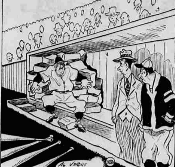
"Oh, he's a good stealer, all right. But he never wants to give them back."

There are only two flies in this otherwise perfect ointment. The food is "lousy" in Nice, by unanimous vote of the doughboys, and overcautious army doctors have declared most of the Nice and Cannes beaches unsafe for swimming because of polluted water.