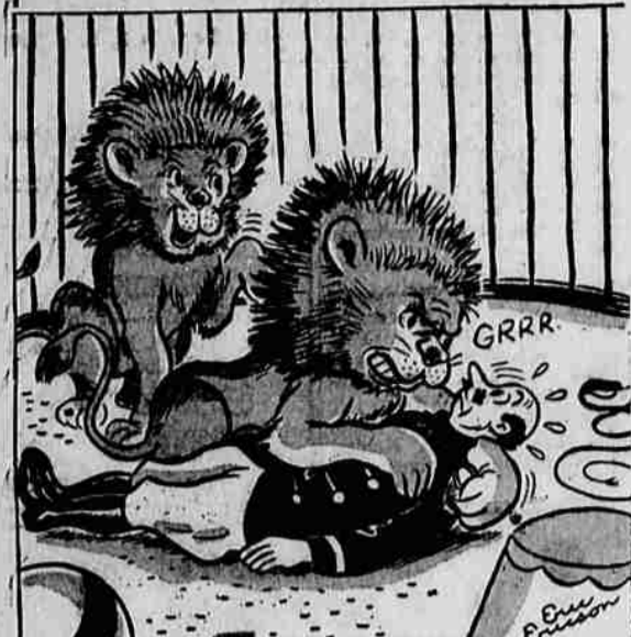
"Restrain yourself, Leo. He buys a War Bond every week."